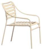
Kahana Strap Club Chair 8007 $94.30