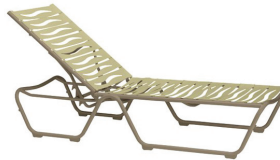
Millennia EZ-Span™ Wave Chaise Lounge 9532WV $251.85