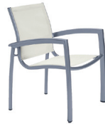
Relaxed Sling Nesting Dining Chair 240524 $181.70 (A-Grade) $194.35 (B-Grade)