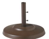
Umbrella Base, 20/24" dia. 65/90 lbs, 17 colors CFA20R15T/F - $88.55 CFA24R15T/F - $120.75