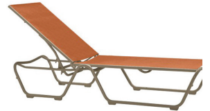
Millennia EZ-Span Relaxed Sling Lounge 220432 $251.85 (A-Grade) $271.40 (B-Grade)