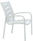
Millennia Wave EZ-Span™ Dining Chair 9524WV $134.55