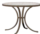
36" Round Dining Table w/ Acrylic Top 1836A/AU $244.95