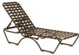
Kahana Cross Strap Chaise Lounge 260532 $217.35 NET