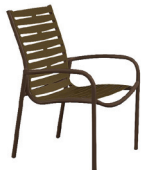
Millennia Ribbon EZ-Span™ Dining Chair 9524RB $134.55