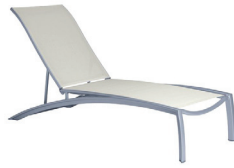
Relaxed Sling Nesting Chaise Lounge 240532 $379.50 (A-Grade) $407.10 (B-Grade)