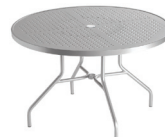
42" or 48" Round Dining Table w/Patterned Aluminum Top 646NSBU/SLU (42") - $324.30 647NSBU/SLU (48") - $371.45