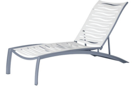
230532RB/WV EZ Span Nesting Chaise Lounge* $379.50