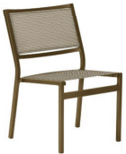
Cabana Club Side Chair 591028 $167.90 (A-Grade) $179.40 (B-Grade)