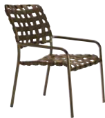
Kahana Cross Strap Dining Chair 260524 $105.80