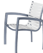
230524RB/WV EZ Span Nesting Dining Chair* $178.25