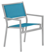
Cabana Club Arm Chair 591037 $189.75 (A-Grade) $202.40 (B-Grade)