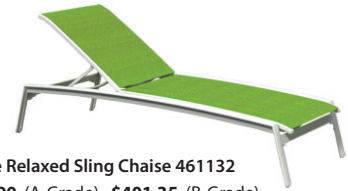
E lance Relaxed Sling Chaise 461132 $374.90 (A-Grade) $401.35 (B-Grade)