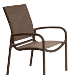
Millennia Relaxed Sling Dining Chair 220424 $134.55 (A-Grade) $144.90 (B-Grade)