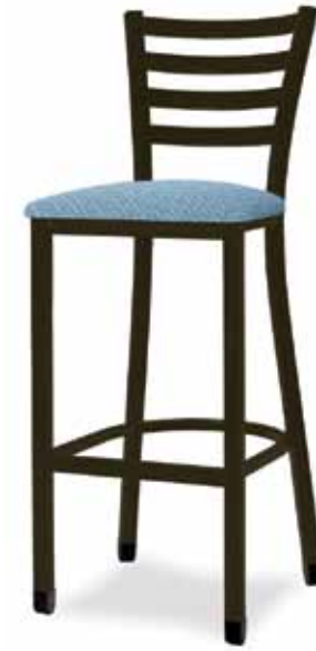
SR806-2 (barstool) 43.25H x 18W x 20D 28.25 SH Yards: .4