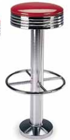
C5788 with Footring 12.5 Seat Diameter 24 SH with 15 Footring 30 SH with 15 or 22 Footring Yards: .5