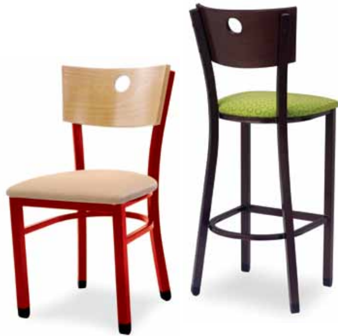
SR823 (side chair) 33H x 17.5W x 19.5D 18.5 SH Yards: .4 SR823-2 (barstool) 43.25H x 17.5W x 20D 28.25 SH Yards: .4