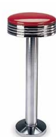
C5788 12.5 Seat Diameter 18, 24, and 30 SH Yards: .5