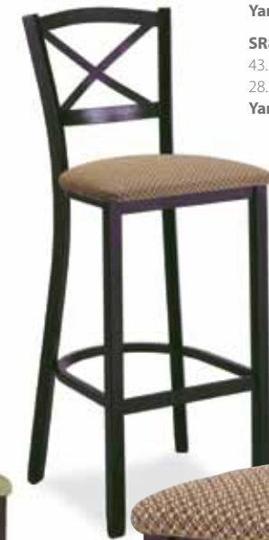
SR844 (side chair) 32.5H x 18W x 20D 18 SH Yards: .4 SR844-2 (barstool) 43.25H x 18W x 20D 28.25 SH Yards: .4