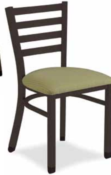
SR806 (side chair) 32.5H x 18W x 20D 18 SH Yards: .4