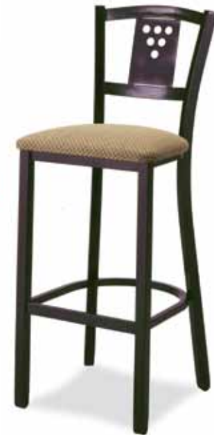
SR845 (side chair) 32.5H x 18W x 20D 18 SH Yards: .4 SR845-2 (barstool) 43.75H x 18W x 20D 28.25 SH Yards: .4