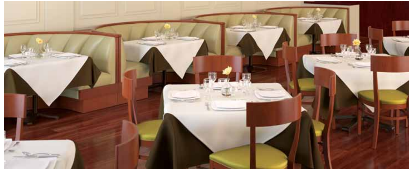
Custom Booth, 4127 Chair, B62 Table base

Visit shelbywilliams.com to view our full line of wood and metal chairs/barstools, booths/banquettes, and tables.