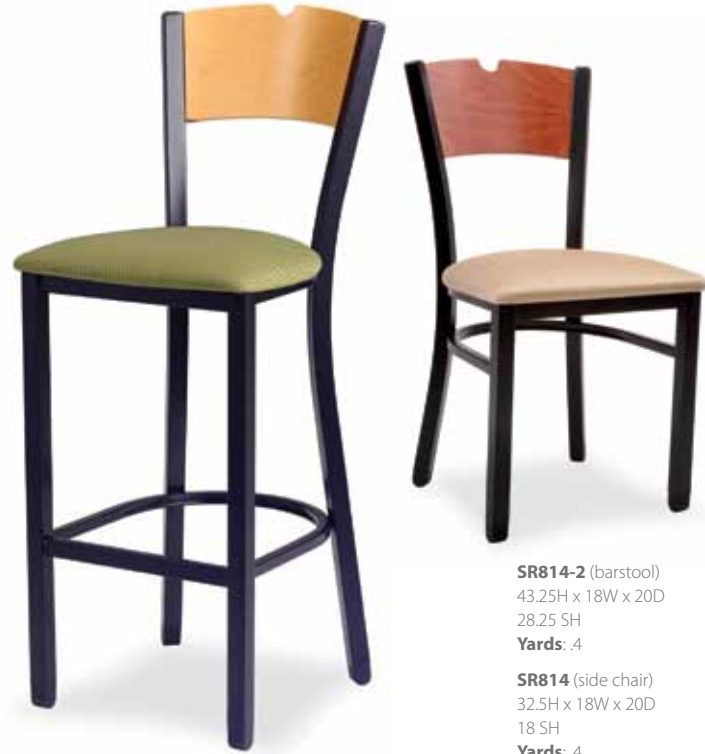
SR814-2 (barstool) 43.25H x 18W x 20D 28.25 SH Yards: .4 SR814 (side chair) 32.5H x 18W x 20D 18 SH Yards: .4